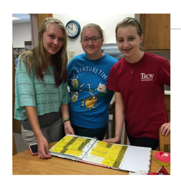
Library Scrapbook Project Volunteers