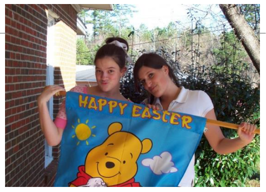
Facility Maintenance Volunteers