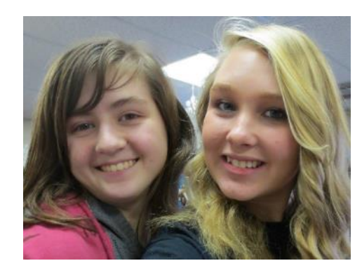
Story Hour Angels

Students from public, private, & home settings working together at TPL