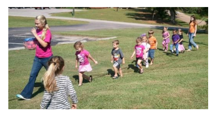
Story Hour Volunteers