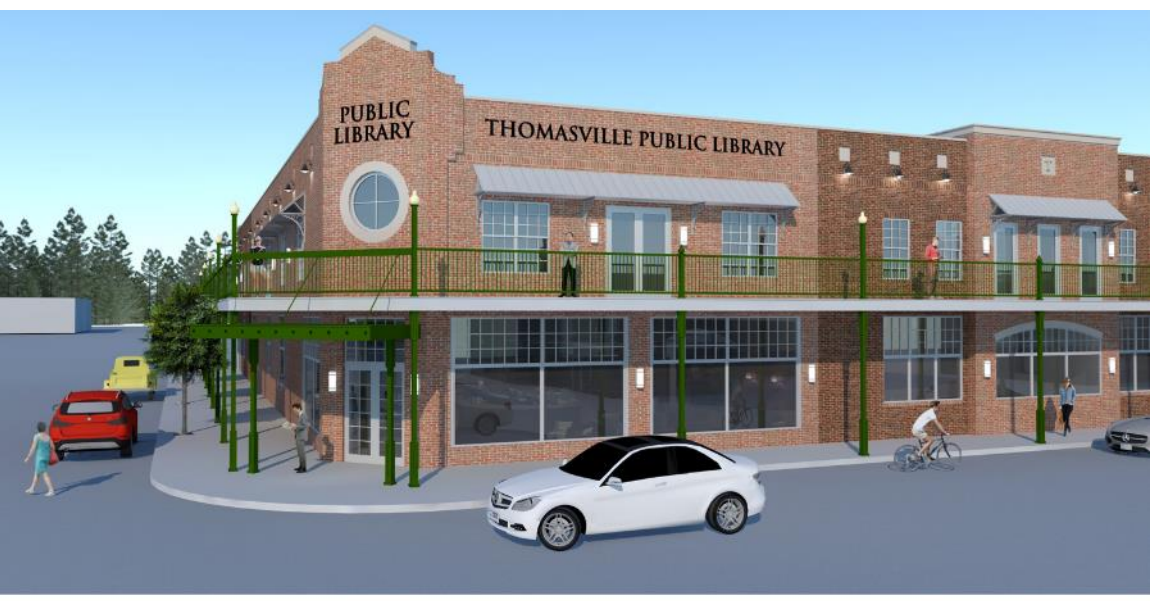
Thomasville Public Library Thomasville, Alabama