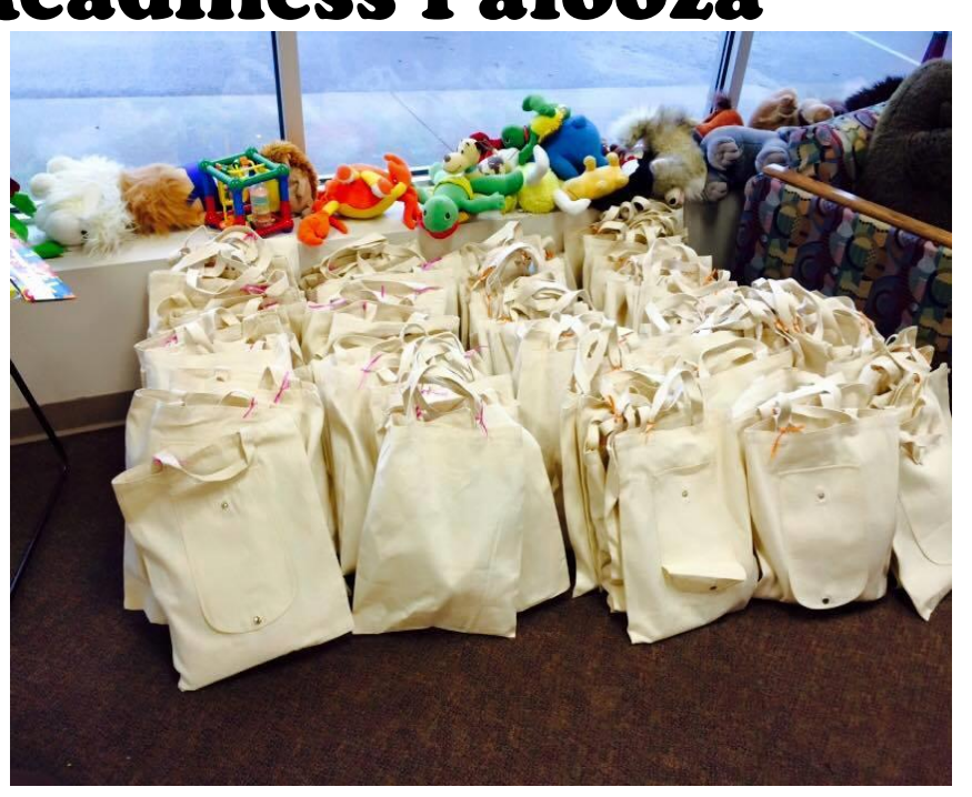
School Readiness Bags Alphabet/Numbers Puzzles, Dry Erase Boards and Markers, Alphabet and Number Workbooks etc.