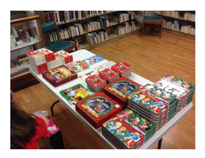
Free Books for all Children birth to 5