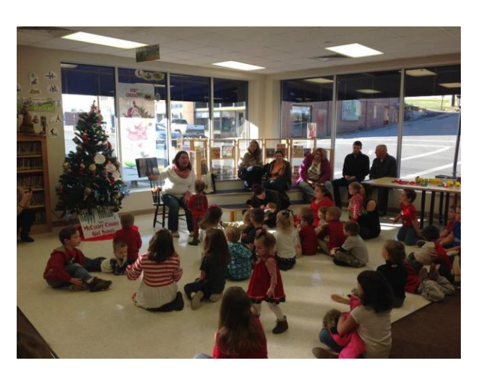
Story Time Programs