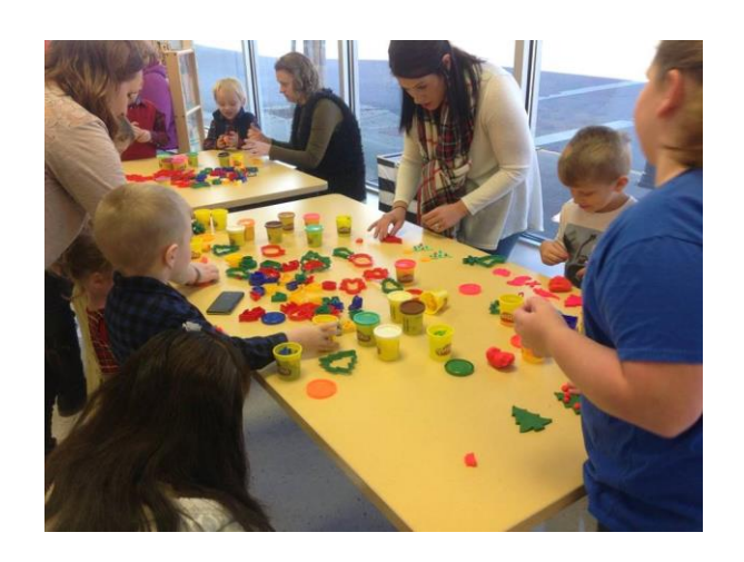
School Readiness Activity Stations