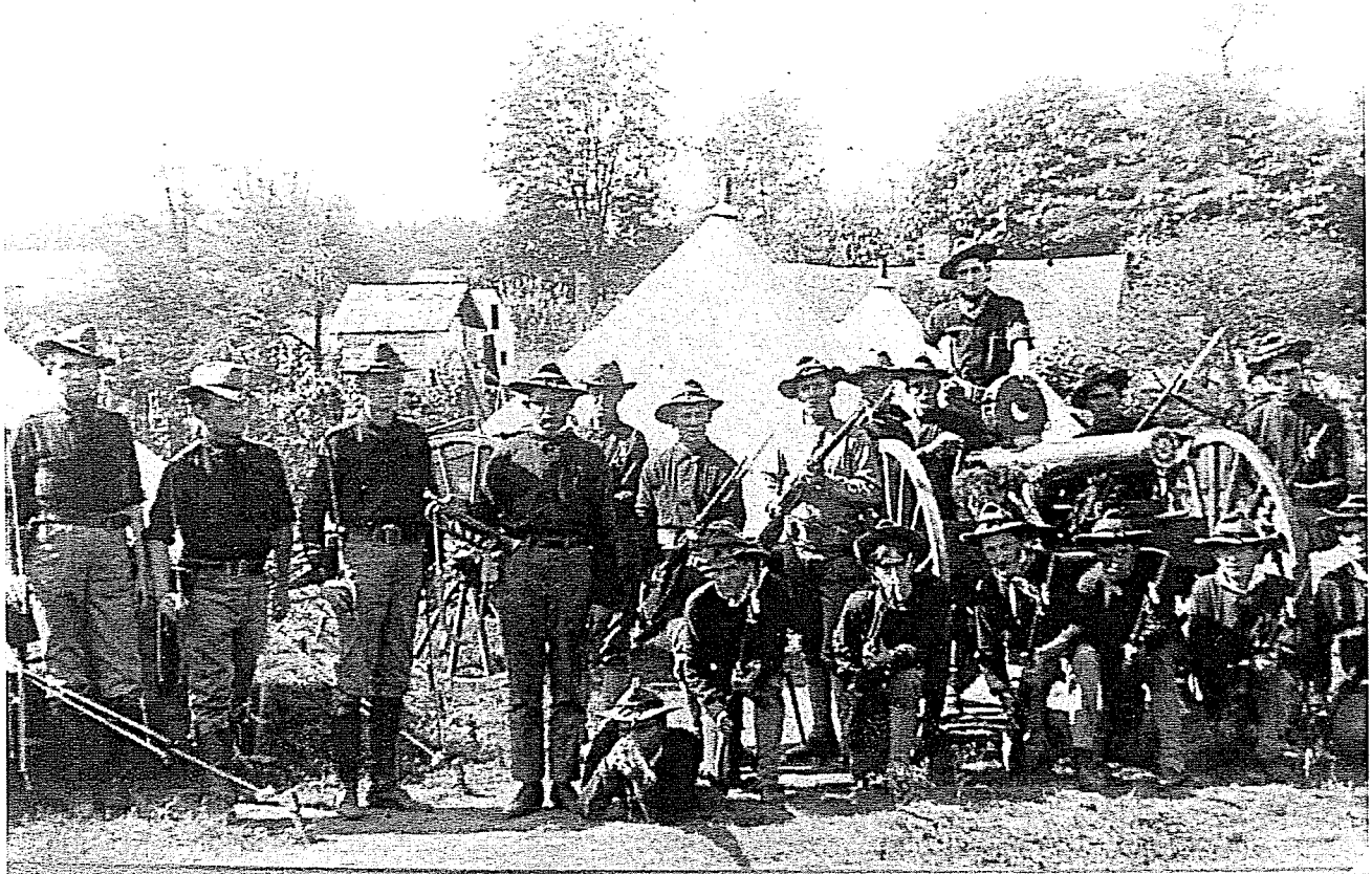
This photo of a military unit probably dates from before 1900. Neither the unit nor any of the individual soldiers are identified. The Gatling Gun has an Accless magazine that was first used in 1883 and remained in service until 1898 when it was replaced because of a tendency to jam with heavy use. The rifles have characteristics of the Krag-Jorgensen model used from around 1894 until 1903, when the Springfield 30.06 caliber was adopted. Can any of our readers help with a more complete identification of this picture?

Friends of Kentucky Public Archives, Inc. P.O. Box 4224 Frankfort, Kentucky 40604