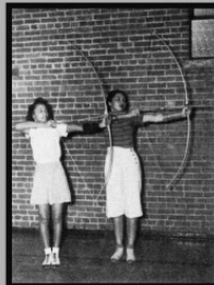
Kentucky State College Students, 1948. Kentucky Archives Month Card 8