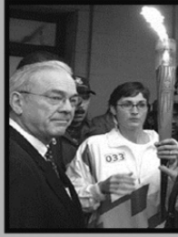
Governor Paul Patton watches as the Olympic Torch runners transfer the flame during a ceremony at the Kentucky State Capitol, December 17, 2001. Kentucky Department for Libraries and Archives Kentucky Archives Month Card 5