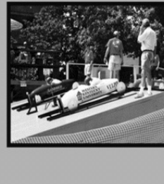
Children participating in a soap box derby race down College Heights Hill, May 22, 1999. Western Kentucky University Archives Kentucky Archives Month Card 9