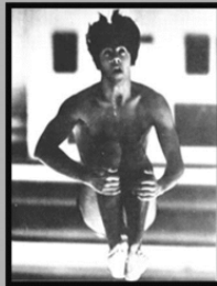
Westport High Diver, 1976. Westport High has since become Westport Middle School. Kentucky Archives Month Card 4