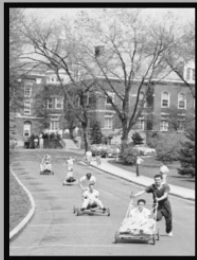
Push cart race held during the Little Kentucky Derby at the University of Kentucky, nd. Kentucky Archives Month Card 7