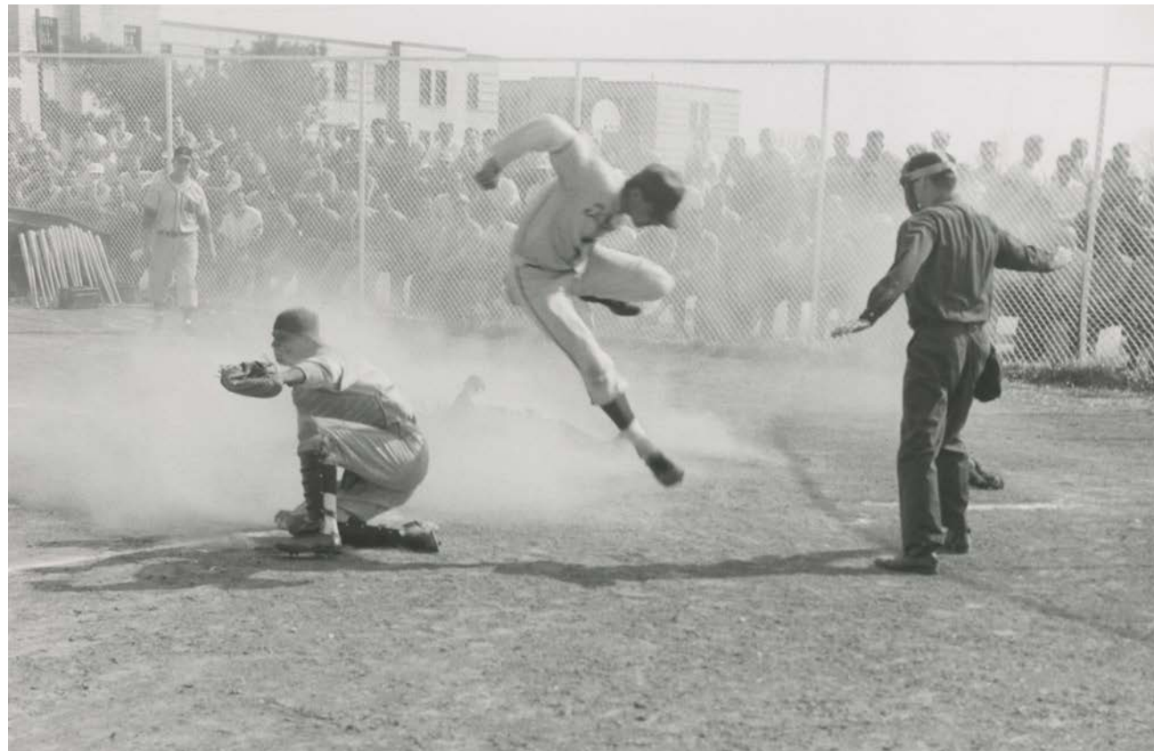
Safe! A scene from a baseball game at the Kentucky State Reformatory in LaGrange. 1950s.

We won't be able to contact individual readers or send out reminders, so don't miss out, send us your email information today!