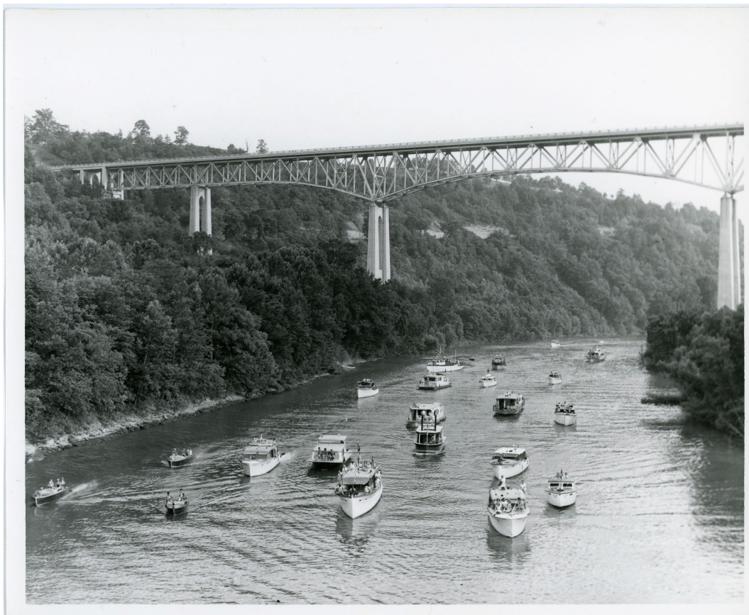
Boats Under the I-64 Bridge in Frankfort. Undated.

Friends of Kentucky Public Archives, Inc. P.O. Box 4224 Frankfort, Kentucky 40604 RETURN SERVICE REQUESTED