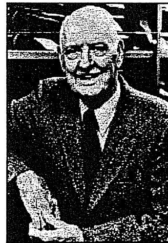
Dr. Thomas D. Clark