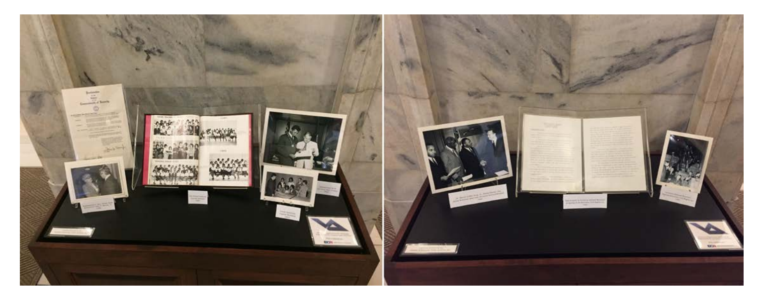
February 2018 Display Items: Black History Month

Follow the State Archives on Social Media: