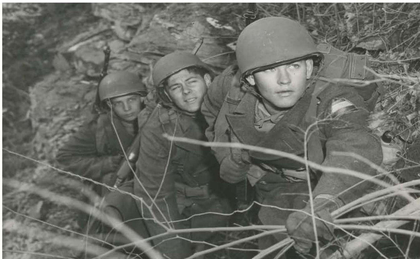
Fort Knox trainees, 1948-1952.

Friends of Kentucky Public Archives, Inc. P.O. Box 4224 Frankfort, Kentucky 40604 RETURN SERVICE REQUESTED