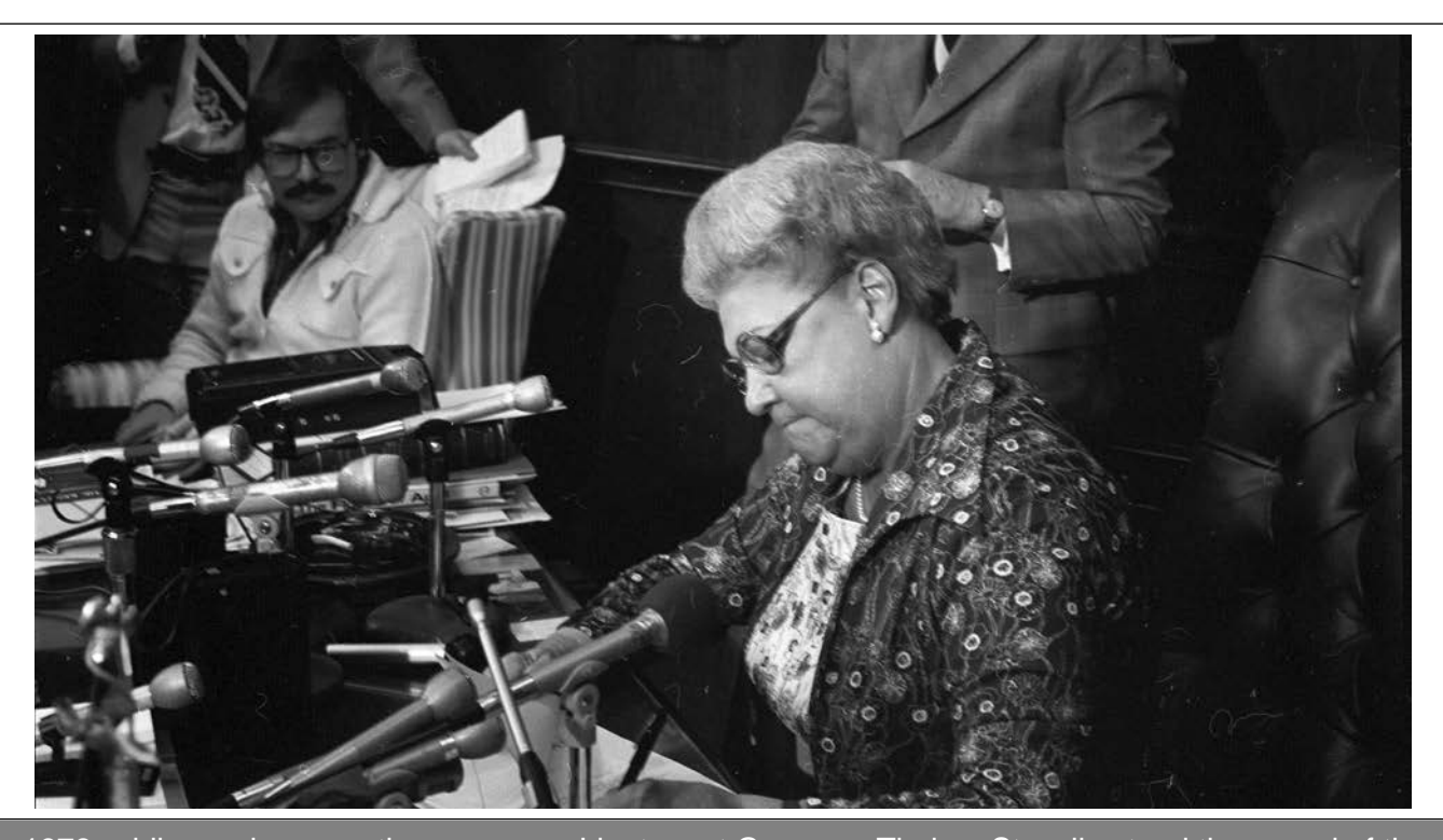
In 1978, while serving as acting governor, Lieutenant Governor Thelma Stovall vetoed the repeal of the ratification of the Equal Rights Amendment.

Friends of Kentucky Public Archives, Inc. P.O. Box 4224 Frankfort, Kentucky 40604 RETURN SERVICE REQUESTED