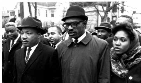
1964 - Martin Luther King Jr. leads Freedom March in Frankfort, Kentucky.