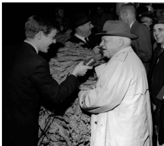
1961—Nick Clooney interviews Kentucky Agriculture Commissioner Emerson Beauchamp.

Since 1958, KDLA has been the official state repository for over 45,000 Kentucky state agency publications dating from 1792 to present. These publications offer a rich source of information on the history of the Commonwealth.