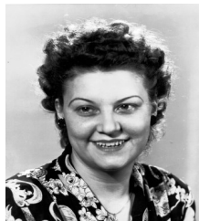
1950 - Lt. Gov. Thelma Stovall (then State Representative)