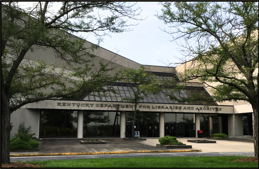
The front entrance of the Clark-Cooper Building, Kentucky Department for Libraries and Archives. 2018.