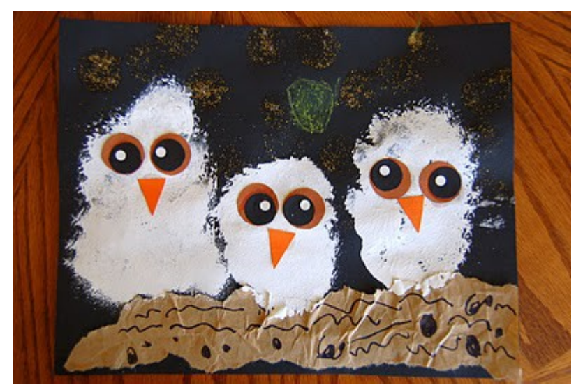
Owl Babies Craft <a href="http://iheartcraftythings.b">http://iheartcraftythings.b</a> <a href="logspot.com/2011/09/owl">logspot.com/2011/09/owl</a> <a href="http://ebabies-craft.html">-babies-craft.html</a>