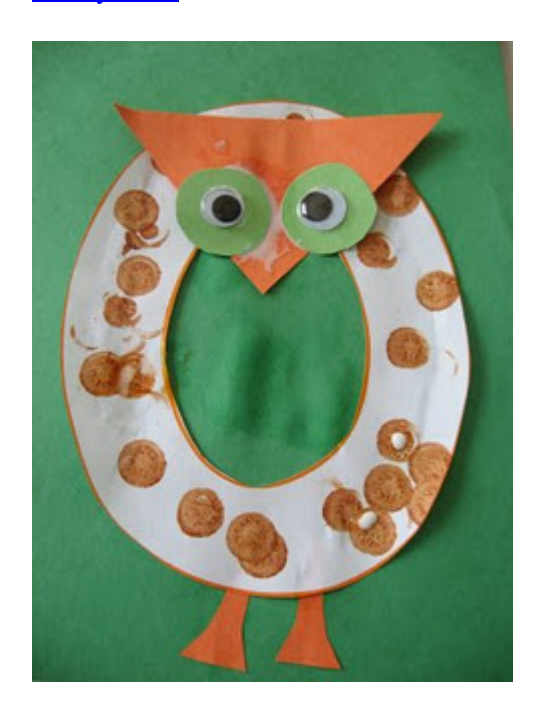
Site includes other owl crafts and printables, too! <a href="http://mamasmonkeys.blogspot.com/2011/08/owl-tot-pack.html">http://mamasmonkeys.blogspot.com/2011/08/owl-tot-pack.html</a>