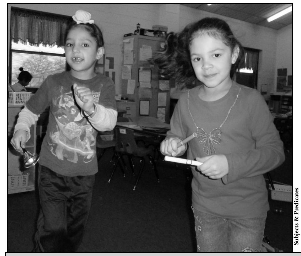
Teaching children healthy habits is vital to maintain healthy weights and build strong muscles. Engage in movement activities with music to help children appreciate the importance of vigorous physical activity.

Be an advocate. Talk to school administrators and families about how vigorous physical activities can prevent children's obesity and support healthy development (Edwards, Bayless, & Ramsey, 2009). Focus on the importance of eating healthy food, engaging in outdoor and indoor active play, and modeling