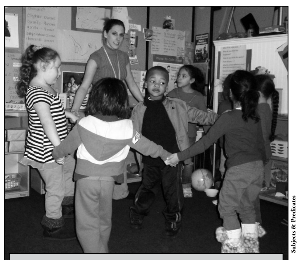
The most compelling music and movement activities are enjoyable and voluntary so that all children can appreciate the joy and beauty of the experience for its own sake. When teachers offer intriguing activities to children daily, reluctant children are likely to join in over time.

Keep activities short. Toddlers usually stay engaged for about 10 minutes (Miller, 2005). Scarves, instruments, and other props are likely to maintain their interest longer.