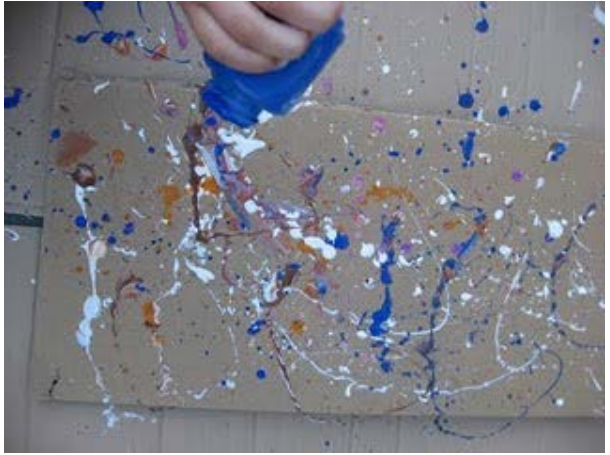
Create a Mini Art Museum <a href="http://www.notimeforflashcards.com/category/art-museum">http://www.notimeforflashcards.com/category/art-museum</a>