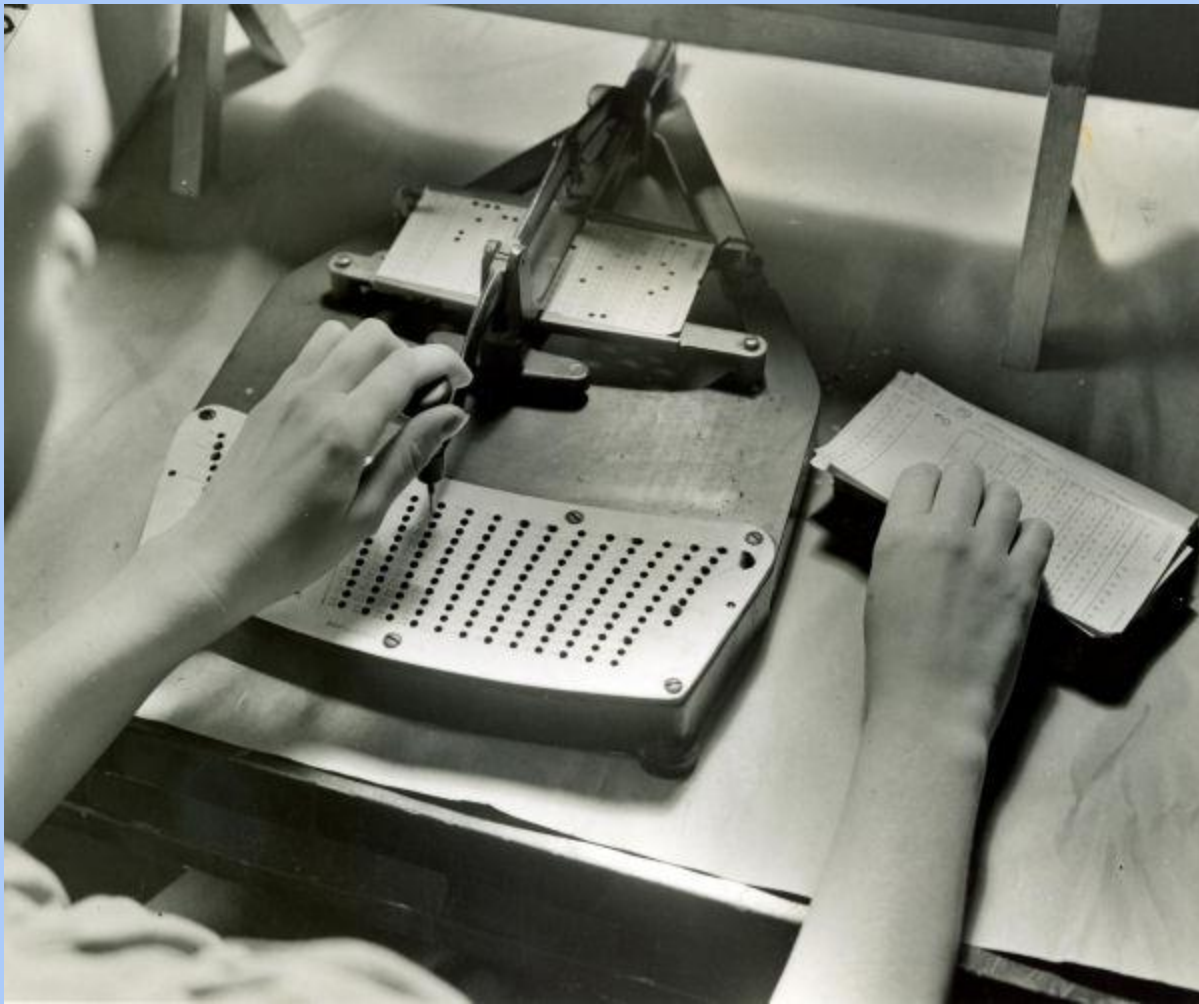
A pantograph used to create punch cards