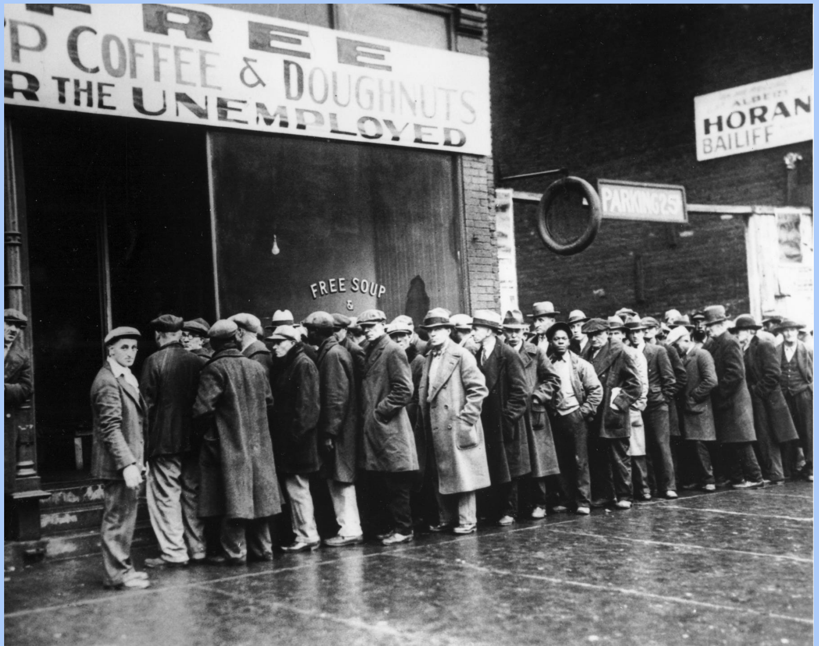
The stock market crash of 1929 led to 23% unemployment rate