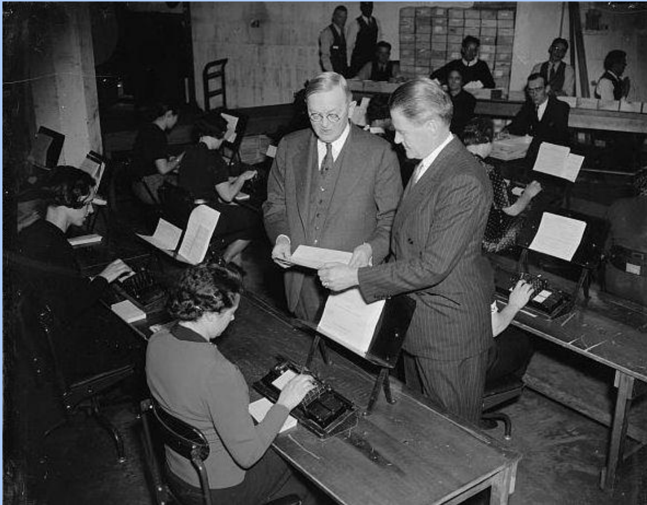
Census Bureau employees creating Soundex cards (ca. 1936-).