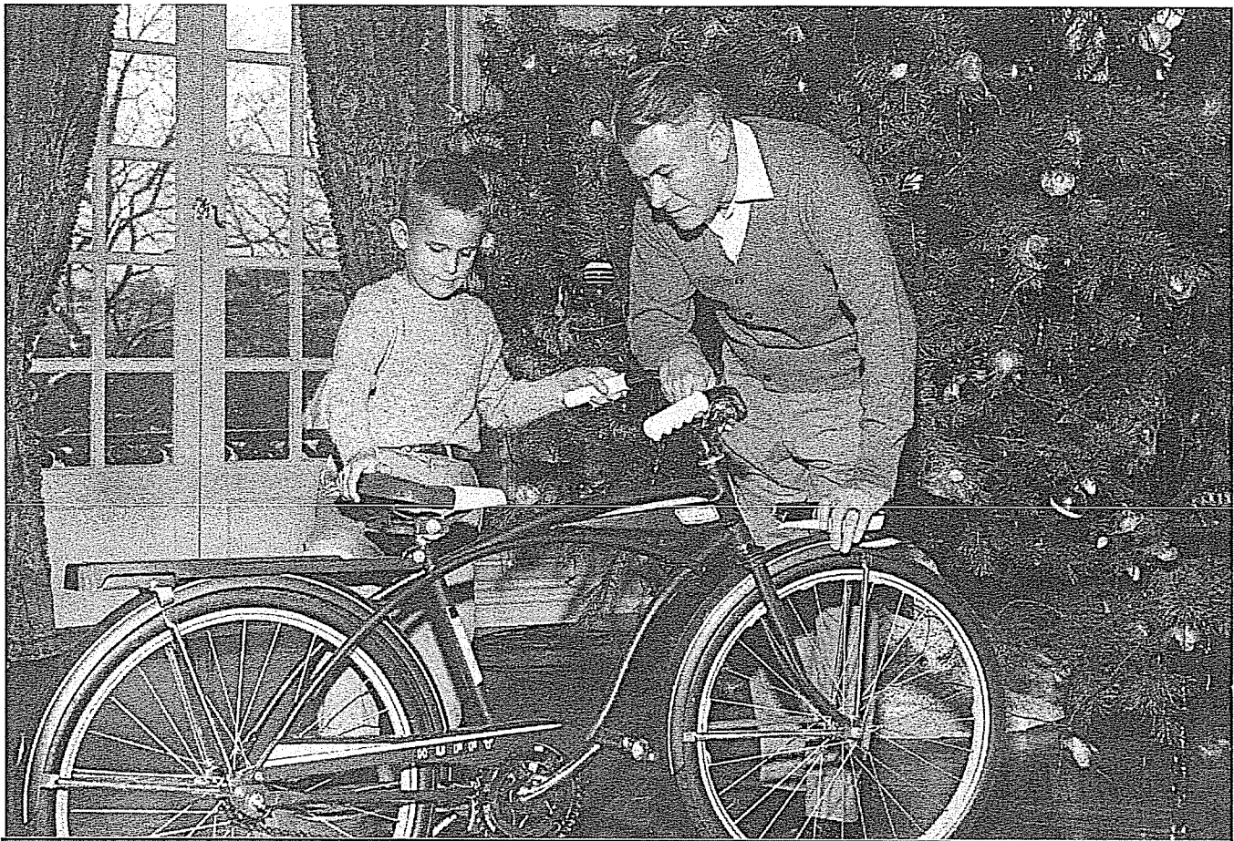
Governor Bert Combs celebrated the holidays with his son at the Governor's Mansion in the early 1960's.

Friends of Kentucky Public Archives, Inc. P.O. Box 4224 Frankfort, Kentucky 40604