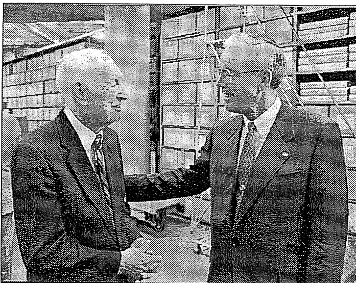
Planning for an expanded State Archives continues under recently approved capital appropriations from the General Assembly. Shown here are Dr. Thomas D. Clark and Governor Paul Patton during the Governor's earlier assessment tour of the State Archives space needs.