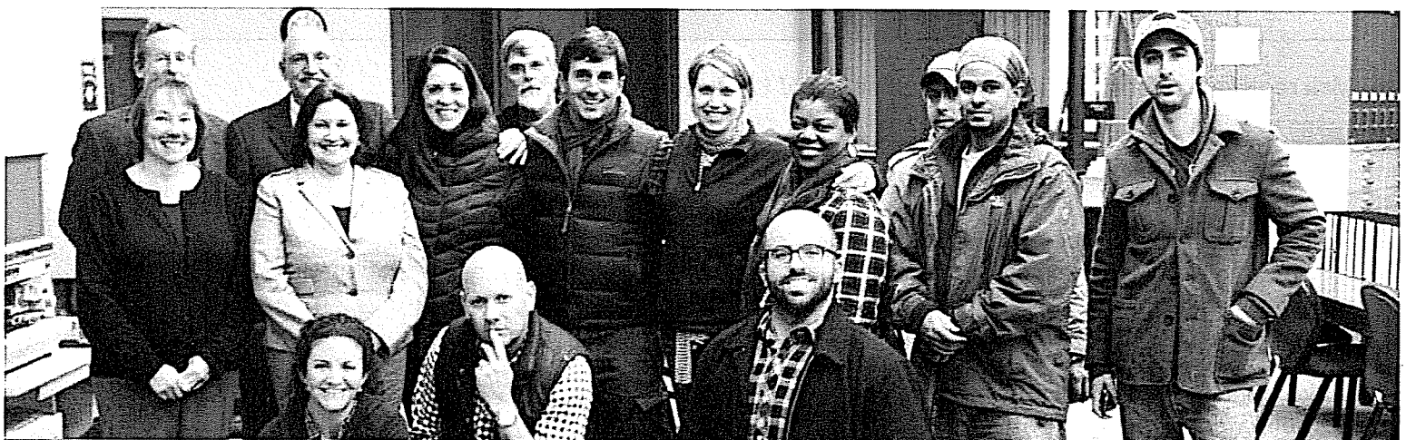
Film crew from "Who Do You Think You Are?" and KDLA staff in the Archives Research Room following a day of shooting for the Jerome Betis episode.

Only a few states are currently indexed, not including Kentucky, but patient researchers who have some idea of the place of residence of specific individuals can still find those records by reviewing the Enumeration District maps available through the NARA website, or through Ancestry ( www.ancestry.com ). Recent estimates for the completion of a nationwide index place the project within the 2012 calendar year. Researchers can access the NARA and Ancestry sites through the public use computers in the Archives Research Room, and staff are available to assist as needed.