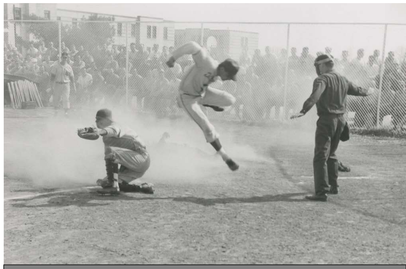
Safe! A scene from a baseball game at the Kentucky State Reformatory in LaGrange. 1950s.

Friends of Kentucky Public Archives, Inc. P.O. Box 4224 Frankfort, Kentucky 40604 RETURN SERVICE REQUESTED