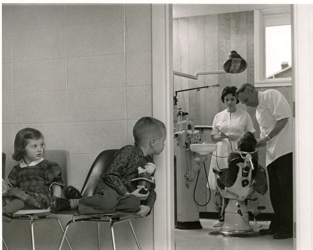
Children at the Dentist, 1962

Friends of Kentucky Public Archives, Inc. P.O. Box 4224 Frankfort, Kentucky 40604 RETURN SERVICE REQUESTED