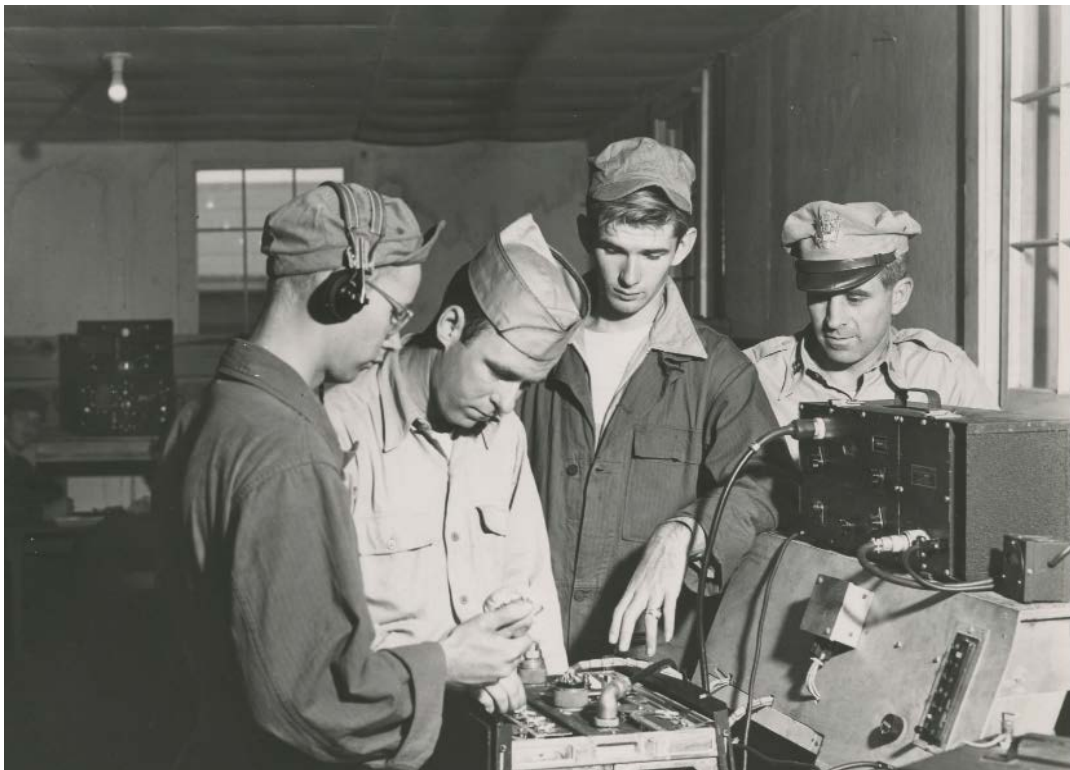
Communication Section Checking Radios, Standiford Field, KY, 1948-1952.

Friends of Kentucky Public Archives, Inc. P.O. Box 4224 Frankfort, Kentucky 40604 RETURN SERVICE REQUESTED