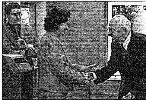
Dr. Thomas D. Clark received the first Kentucky Archives Week Award in 2002. The award was subsequently named "The Thomas D. Clark Kentucky Archives Week Award."