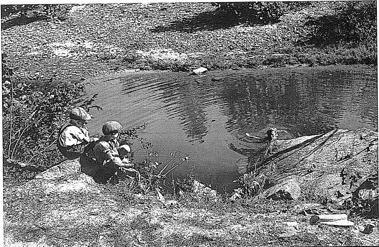
Old swimming hole up South Fork in Breathitt County, 1940.

Friends of Kentucky Public Archives, Inc. P.O. Box 4224 Frankfort, Kentucky 40604