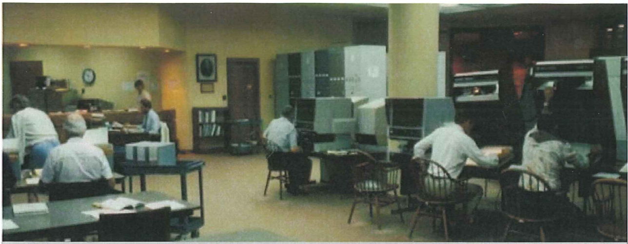
Photo of the Archives Research Room in 1995.