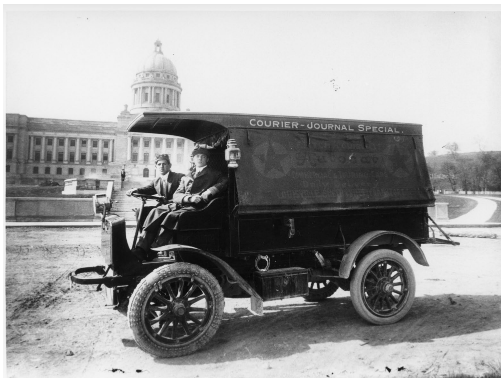
Courier-Journal delivery to the Kentucky State Capitol building in Frankfort, ca. 1910s.

Friends of Kentucky Public Archives, Inc. P.O. Box 4224 Frankfort, Kentucky 40604 RETURN SERVICE REQUESTED