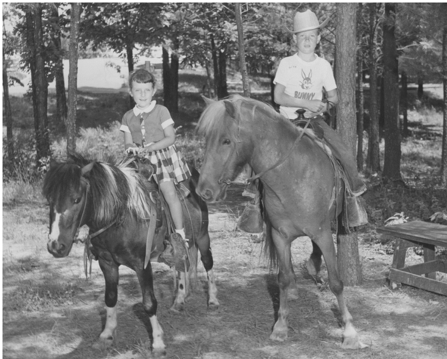
Family Trail Ride, undated.

Friends of Kentucky Public Archives, Inc. P.O. Box 4224 Frankfort, Kentucky 40604 RETURN SERVICE REQUESTED